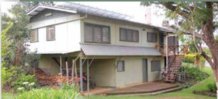
We are enjoying the house we moved into in mid-June. We will be in this house until mid-2017.