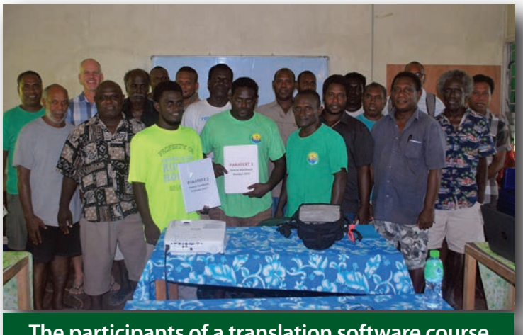
The participants of a translation software course